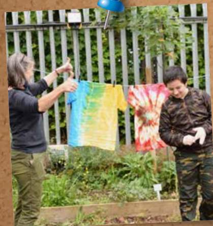
Tie dye workshop at Summer Sessions