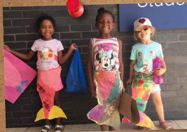
Little Mermaids show what they made in a craft workshop at a Summer School Session in Oasis Hub Ashburton Park

Thanks to your support, our Community Hubs were able to keep going and run Summer Session activities for young people in 22 locations, serve up 32,000 free lunches, run foodbanks and pantries and support families in need.