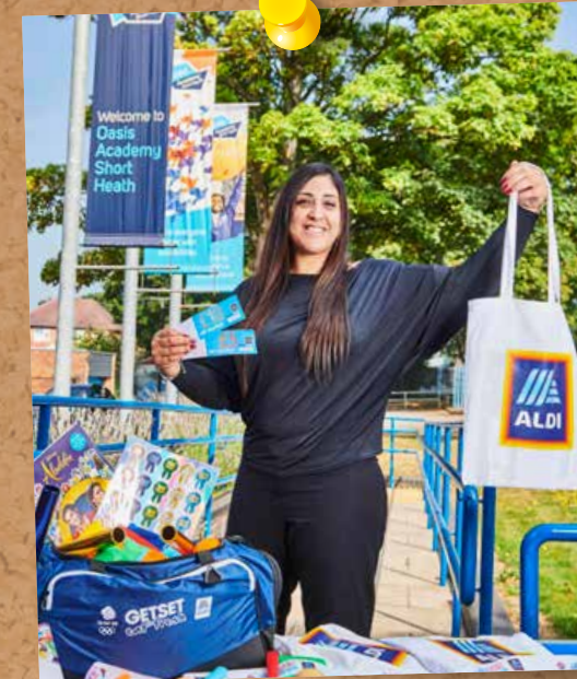
Aldi were one of the many supermarkets who generously supported our food programmes with free produce over the Summer