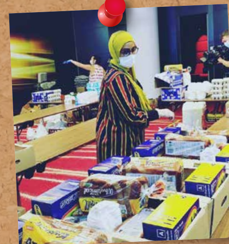
Park Plaza Hotel lent us a huge kitchen and storage area in London where we cooked over 20,000 meals for delivery