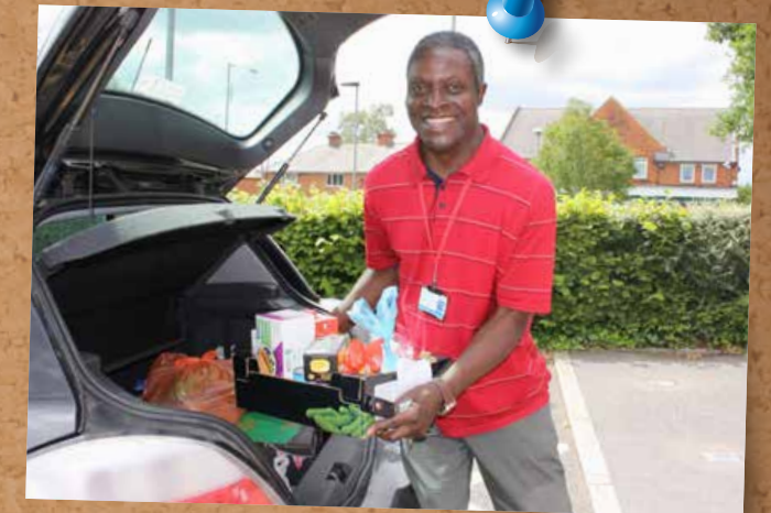
Just one of the scores of Hub volunteers who delivered food parcels in lockdown.