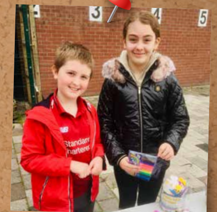
Children signing in to Covid-compliant Summer Sessions in Oldham